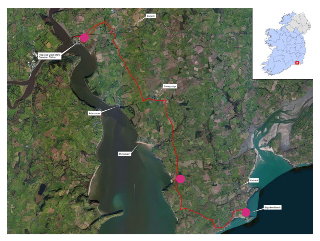
Figure 1: Cable Route and Locations of Construction Compounds (indicated thus background mapping from Bing © Microsoft 2020)

At the Campile Estuary it is proposed that a horizontal directional drill (HDD) will pass under the estuary and woodland at a depth of >10m. An overview of the route is provided in Figure 1 .